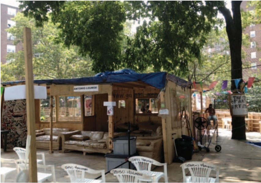
"Antonio Lounge" at the Gramsci Monument