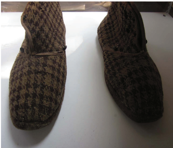
Gramsci's slippers on display in the Bronx (on loan from the Casa Museo di Antonio Gramsci)

And the idea that the monument is cultural work and that Hirschhorn is an artist, not an activist, brings me to the significant Gramscian angle in this new way of being a monument (to riff off of Pier Paolo Pasolini's line, "a new way of being Gramscian").